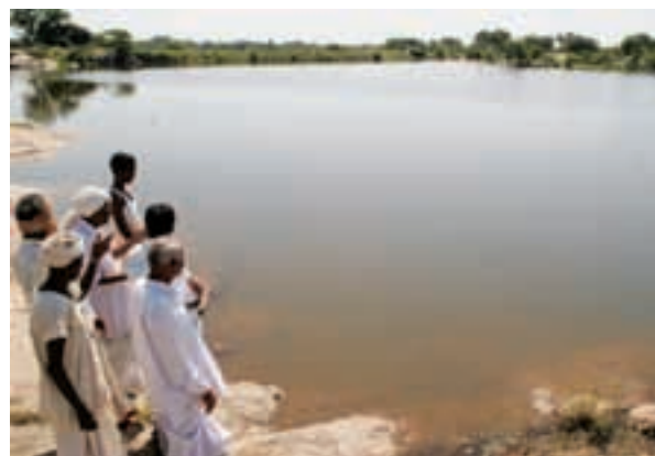
Adapting to climate change by conserving water

MPRLP has recently initiated a scoping study of how carbon markets can be used to support rural livelihoods in Madhya Pradesh, and DFID is also supporting training in the preparation of carbon offset projects in both Madhya Pradesh and Orissa. We are also designing a Climate Change Innovation Programme with the Ministry of Environment and Forests that will focus on helping the poor adapt to climate change and benefit from any opportunities offered by the carbon market. We are hopeful that a post-Kyoto agreement on climate change will deepen and widen the continuation the carbon market, unlocking new opportunities for the rural poor to participate.